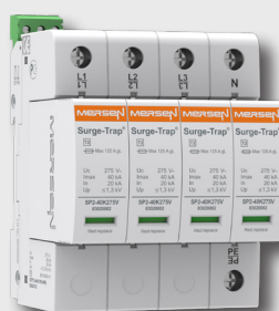
Modular Type 2