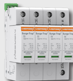
Combined Type 2 & 3