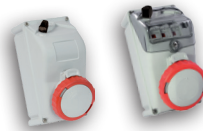
Interlocked Sockets 16A | 32A | 63A | 240V | 415V 2P + E | 3P + E | 3P + N + E

Polifemo distribution boards provide top level performance for a wide range of applications. The robust, user friendly design and choice of durable materials assure compliance to the highest safety standards. Available in two versions, Maxi and Midi, Polifemo can be supplied in any configuration to suite unique, bespoke requirements.