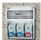
USE For portable and fixed mounting