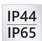
PROTECTION LEVEL Available with protection class IP44 and IP65