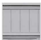
DIN BAR Up to 17 modules