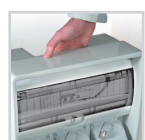
HANDLE Grip/handle for transport

For ease of installation the boards are equipped with press-in, self sealing cable inlet holes.